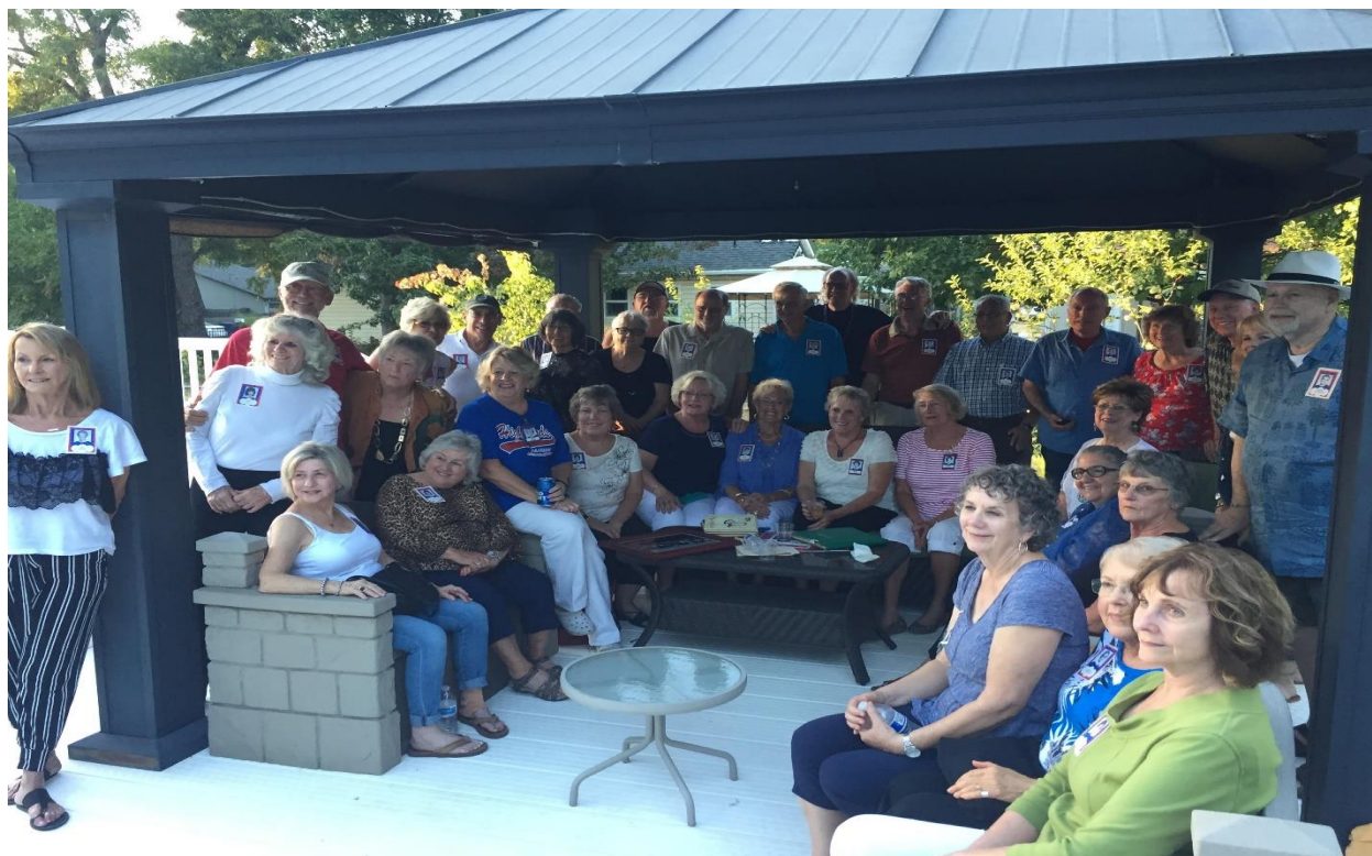
The class of '63 at their barbecue on Saturday night.