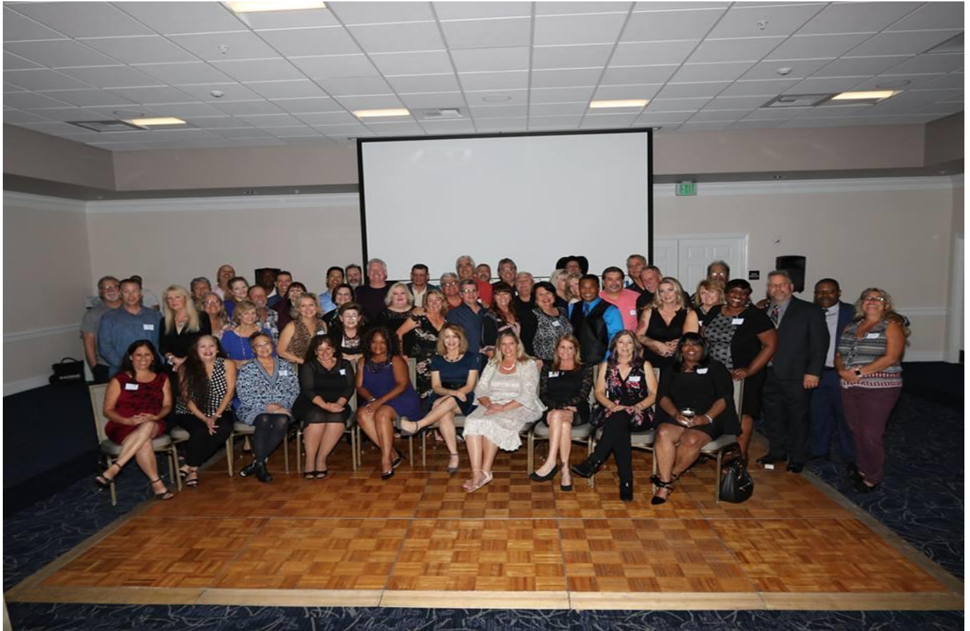
Saturday Night Group Photo