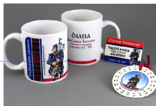
mugs - name badges - ornaments magnets - coasters

Assistant Webmaster-Peggy Ellsbury Colclasure-1967 pellsbury@comcast.net